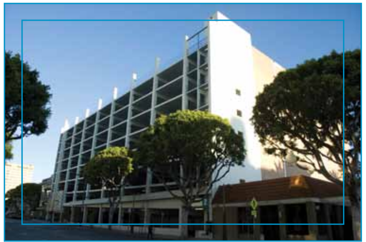
Santa Monica Parking Structure #2.

The upper four floors, added at a later date without the use of shrinkage-compensating concrete, contain some widely distributed random cracks, most of them visible on the top level. Of particular interest is a very noticeable crack running in the north-south direction on the top (9 th ) level at the north end of the building, in the exterior slab span along the grid line separating the west and center aisles. This crack is about 15 feet long, visible at the top and bottom of the slab, measuring \frac{1}{16} inch wide at the top and hairline at the bottom. A similar crack is visible in the asymmetrical location near the southeast corner, but smaller with a measured width of \frac{1}{32} inch at the top of the slab. I did not observe this crack at the same location on any other floor. The crack at the top level may have been aggravated by temperature effects since it is fully exposed to the environment, but the presence of this crack on a floor built with conventional concrete, and its absence on lower floors built with shrinkage-compensating concrete with more severe RTS conditions, suggests that shrinkage-compensating concrete made the difference.