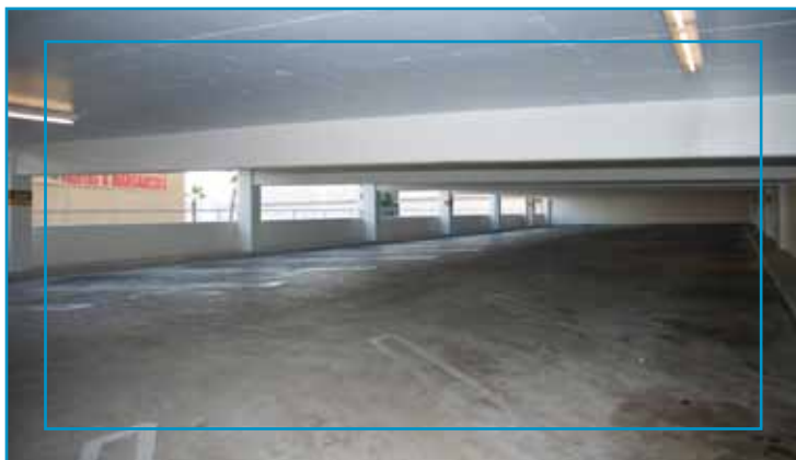
Figure 1: Beam and Slab Framing (4 th Level).

I saw no cracking in any structural member (slab, beam, girder, concrete shearwall, masonry shearwall or column) anywhere else in the lower four floors. I observed some minor spalling between the edge of the slab and the masonry wall at the northeast stairshaft at a few levels. Most experienced observers would rate the condition of these lower floors as excellent, with less than 100 lineal feet of cracking in about 120,000 square feet of elevated deck. This is particularly impressive considering the structure has been extensively loaded and unloaded with automobiles on a daily basis for over 40 years. It has also experienced two major earthquakes of Richter 6.0 or larger (San Fernando in 1971 and Northridge in 1994).