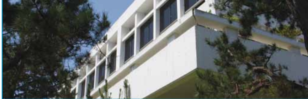
Building M5, southeast corner showing dramatic cantilevered post-tensioned beams at Plaza Level.

pan joists in R6 for extra stiffness) spanning between beams located on and midway between column lines. The intermediate beam was supported by a girder spanning between columns. Seismic framing for both buildings was provided by moment-resistant beam-column frames in both directions.