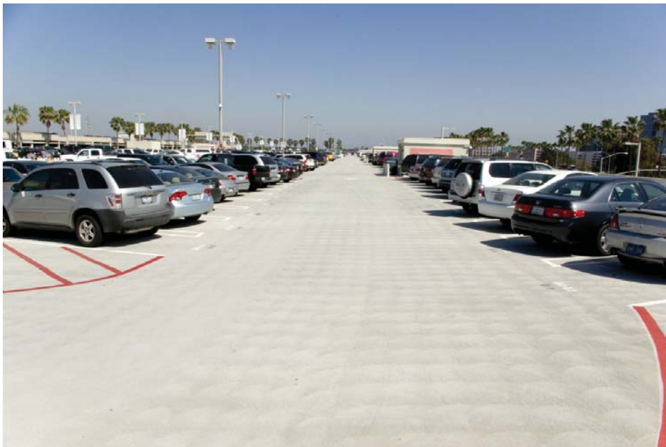
Fig. 12 - The top deck of new parking structure, made with shrinkage compensating concrete, still looks almost new after nine years of heavy use.