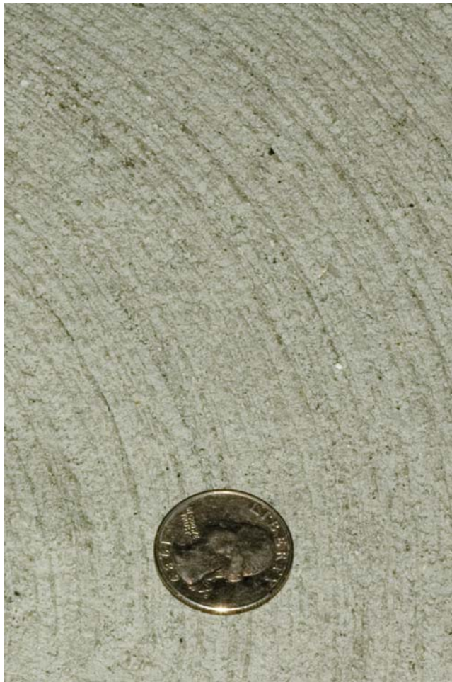
Fig. 11 - After nine years of heavy traffic, the swirled trowel-patterns on the Type K concrete on Level 2 are still crisp and looking new, due to the material's superior abrasion resistance.