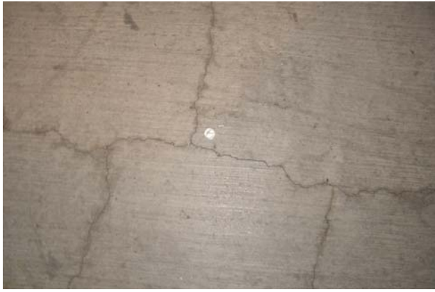
Fig. 6 - When the original structure was built, the slabs - made with portland cement concrete - exhibited drying-shrinkage cracking before the concrete was strong enough for post-tensioning.