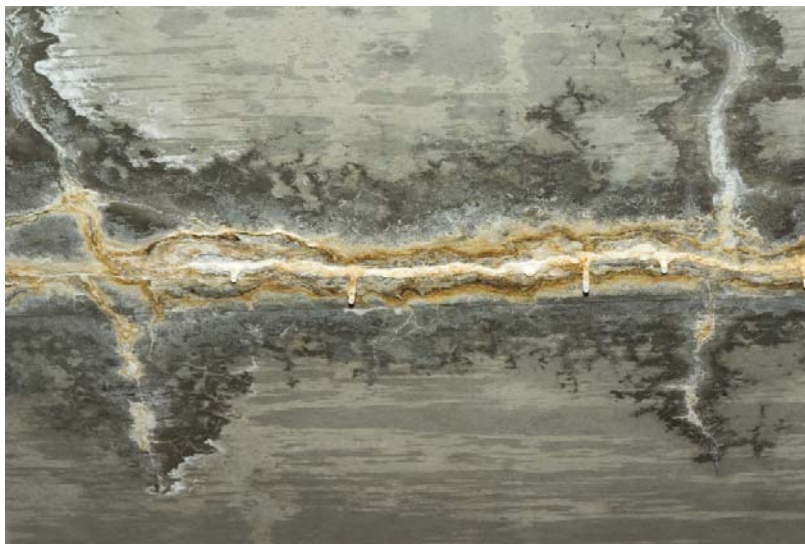
Fig. 8 - Cracks in the Level 1 deck of the original structure as seen from the underside. Water leaking through the cracks carried lime from the interior of the conventional concrete, depositing disfiguring efflorescence and dripping onto cars on Level 0.

Of course, this was not the first time shrinkage compensating concrete had been used with post-tensioning, not even its first application in parking structures. The technologies were combined in a variety of applications in the 1960’s and 70’s, including parking structures built in downtown Santa