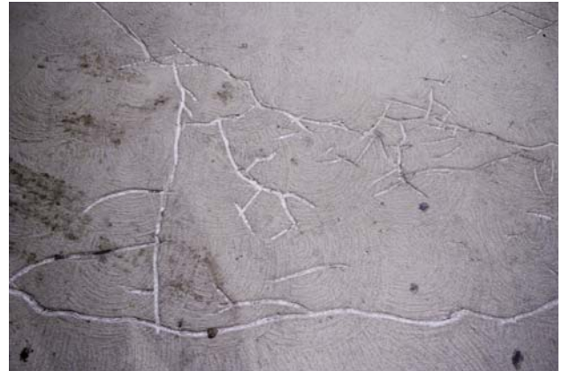
Fig. 7 - 70,000 ft of cracking in Level 1 of the original structure was routed out and sealed to eliminate water infiltrating the slabs or leaking through onto cars on Level 0 below.