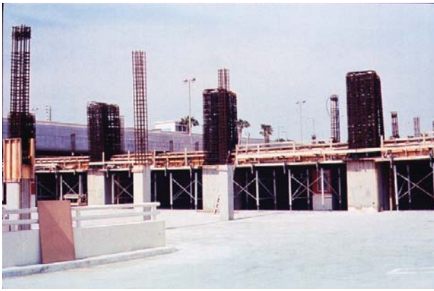
Fig. 9 - Formwork and reinforcement in place in the summer of 1998.