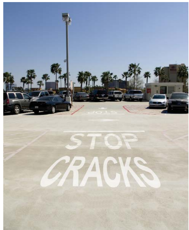
Fig. 1 - Large post-tensioned slabs without drying shrinkage cracks are possible. All you need is the right concrete.

"Shrinkage had already utilized most of the stress resistance that was designed into the structure," Li explains. "Due to shortening movements caused by shrinkage, creep, temperature changes and post-tensioning, residual stresses tend to build up in structures of large plan-dimensions like