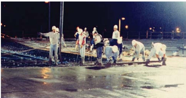
Fig. 10 - Type K concrete was placed at night to accommodate airport traffic regulations and to protect the fresh concrete from excessive summer heat.

Monica CA in 1968. Those structures feature slabs approximately 60 ft X 180 ft which are in excellent condition nearly 40 years after construction. In fact, Teng Li studied the Santa Monica structures while researching the solution for John Wayne Airport.