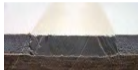
OnePass has almost no shrinkage, even when used to patch deep holes in a single application.

Mixing: Clean mixing bucket and tools between batches. Do not exceed one part of clean, potable water to two parts OnePass powder. First, place water in clean mixing container. Then add OnePass powder. Mix to a smooth, uniform, and lump free consistency by hand or mechanical mixer; mixing usually requires 3 to 5 minutes. Do not add sand, aggregate, cement, or admixtures not described in this document.