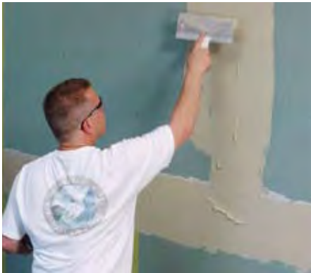
OnePass applies smoothly and easily using standard drywall tools and techniques.

Composition: OnePass is a powder that is ready to use when mixed with water. OnePass contains a hydraulic (water-curing) cement that, when used as directed, cures faster and harder than either portland cement or gypsum-based compounds, and is less prone to shrinkage cracking. It also contains polymers and finely-ground, sandable aggregates.