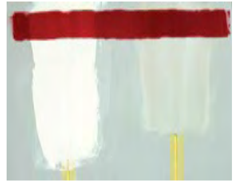
Ordinary joint compound, on left, is visible beneath paint. But OnePass, on right, provides a superior substrate for paint and reduces potential for joint telegraphing and paint discoloration.

serviceable. It is compatible with gypsum board debris recycling programs.