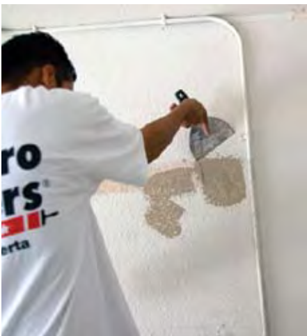
Repair deep holes in a single application.