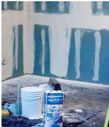
Joint compound can cover 40% of a wall, even more if used as a skim coat. Using the right joint compound is as important as using the right wallboard.

Local and Regional Materials: CTS Cement Manufacturing Corporation has production facilities in Anaheim, CA; Mexico, MO; and Nazareth, PA using locally-sourced aggregates.