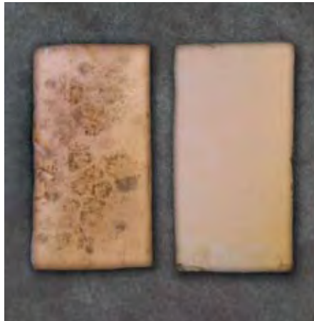
Mold on paint over conventional joint compound.