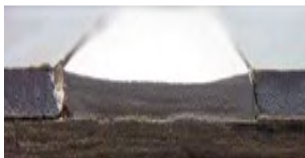
Conventional joint compounds shrink and crack as they dry.

Life Cycle Assessment: OnePass will generally last for the life of a structure or for as long as the substrate to which it is applied remains