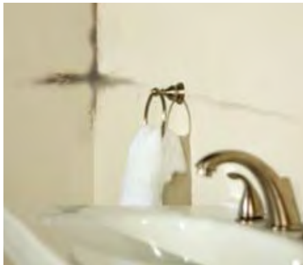
Mold growing on conventional joint compound can be visible through paint.

In addition, OnePass creates a surface that is harder and more scratch-resistant than other joint compounds so it can resist the wear given to walls in commercial and institutional buildings like hospitals and schools.