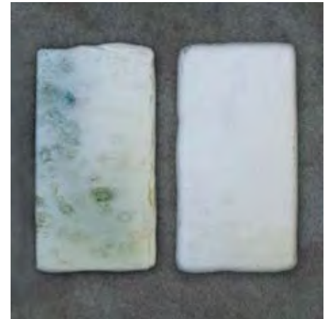
Mold on conventional joint compound.