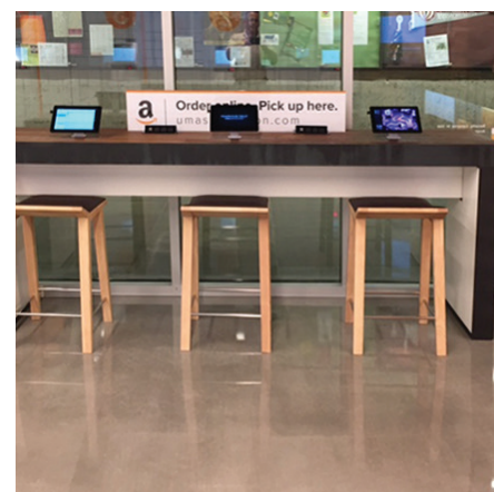
This textbook distribution center at University of Massachusetts Amherst offers high-tech features, such as automated package pick-ups and coded lockers for deliveries.

The distribution center would include high-tech features, such as automated package pick-ups, in which students can open coded lockers to retrieve deliveries. Constructed in a converted third-floor textbook annex, the completed facility would be subject to foot traffic in the ordering area, as well as pallet jacking in the supply room.