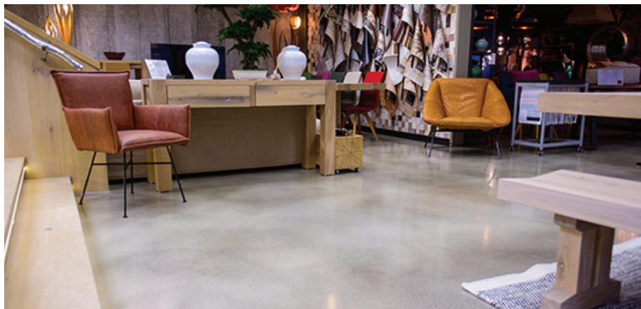
This beautiful concrete floor was finished with a two-tone, cloudy look and polished to a high shine. Contractors completed the work in just three days, using CSA cement-based products.

Original publication: Ruiz, J. (2016, May). Beautiful Floors Fast: The Benefits of Rapid-Setting Cement Products. Durability & Design .