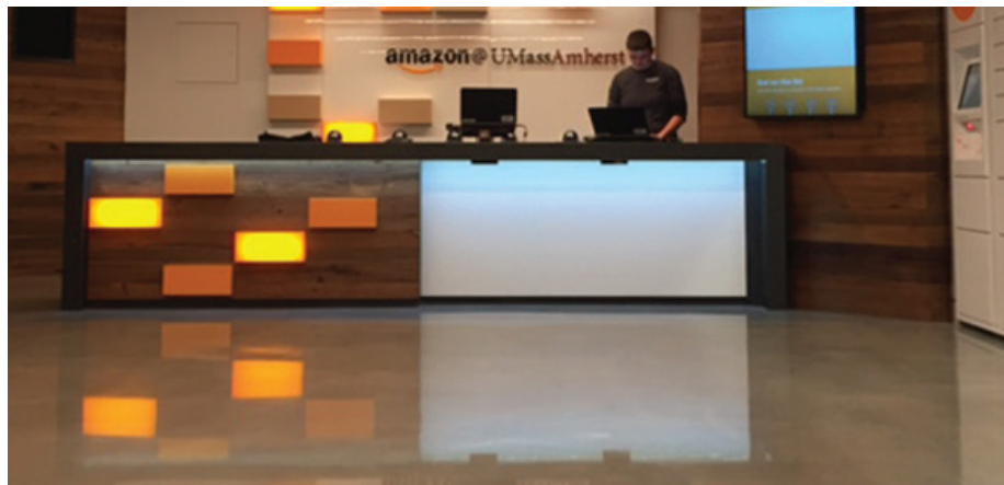
The distribution center's contemporary, polished concrete floor is subject to foot traffic in the ordering area, as well as pallet jacking in the supply room.

Contracted to restore 1,200 square feet of existing flooring, Tri-State Underlayments/Franz Floors Ltd. of Waterbury, Conn., had only four days to complete the work before interior framing began. To meet this timeframe, the contractor chose a CSA cement product because it sets quickly and achieves high strength in one day.