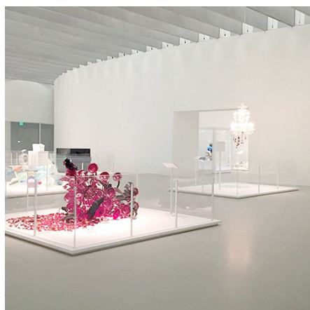
The one-component CSA cement-based topping system cures to a light off-white color, and may be stained, dyed or integrally colored. Adding custom pigment achieved a very light gray that was perfect for the light-filled space.

Before installing the self-leveling topping,