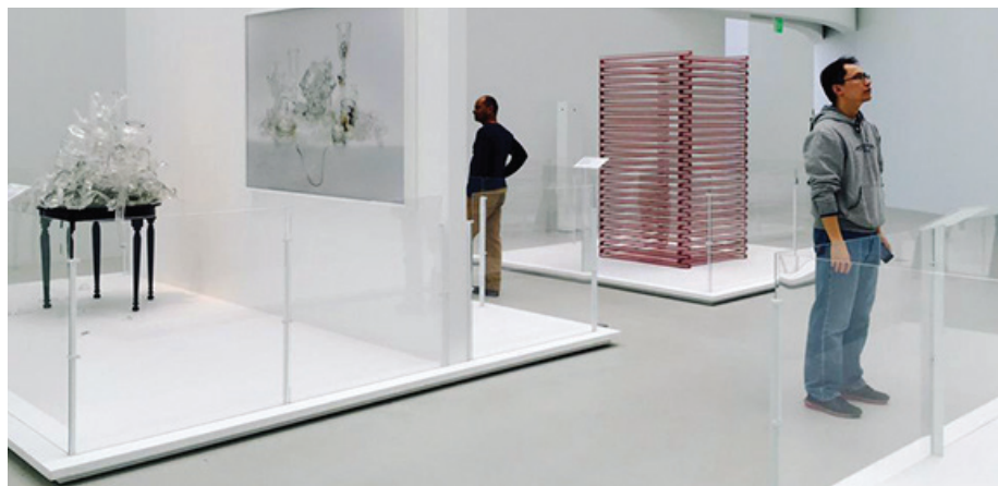
Simple white interiors and natural light welcome visitors in the Contemporary Art + Design Wing at the Corning Museum of Glass in Corning, NY. (See Project 2, below.)

For decades, portland cement has been the standard for concrete floors, but the material presents a number of challenges, including excessive shrinking and slow set times. It can't be accelerated without negative effects, is susceptible to attack by prevalent chemicals and reacts destructively with certain aggregates. One way to solve these problems is by using calcium sulfoaluminate (CSA) cement.