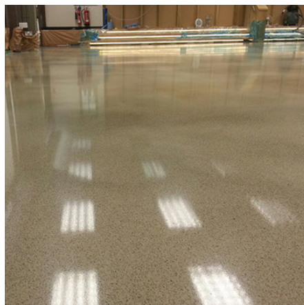
Top: Contractors installing a CSA cement-based self-leveling topping. The one-component system was poured at a depth of 12 mm and cured for 24 hours. Bottom: The floor was finished with two coats of acrylic polish and burnished with a white pad to achieve a high gloss.